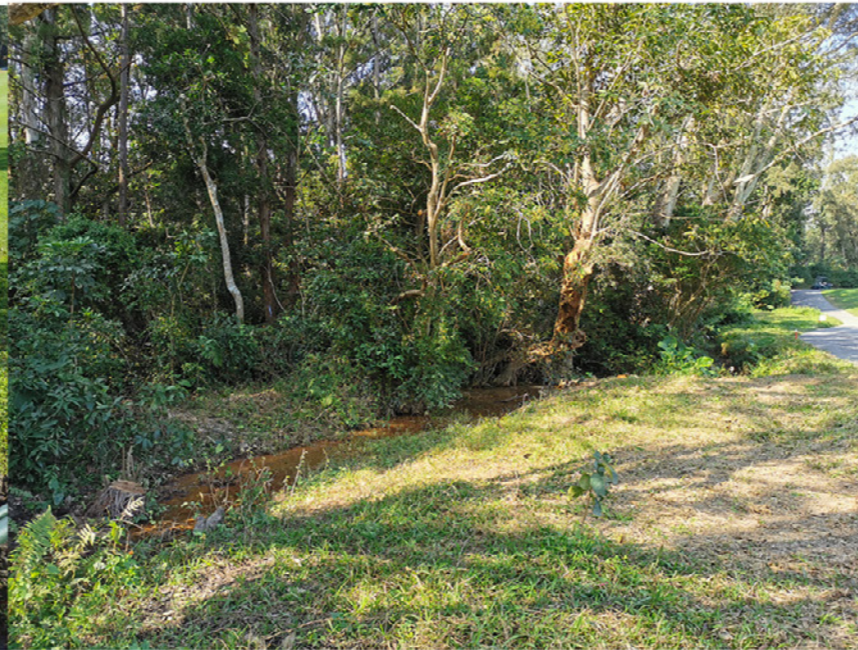
LR4.1 WATERCOURSE IN GOLF COURSE