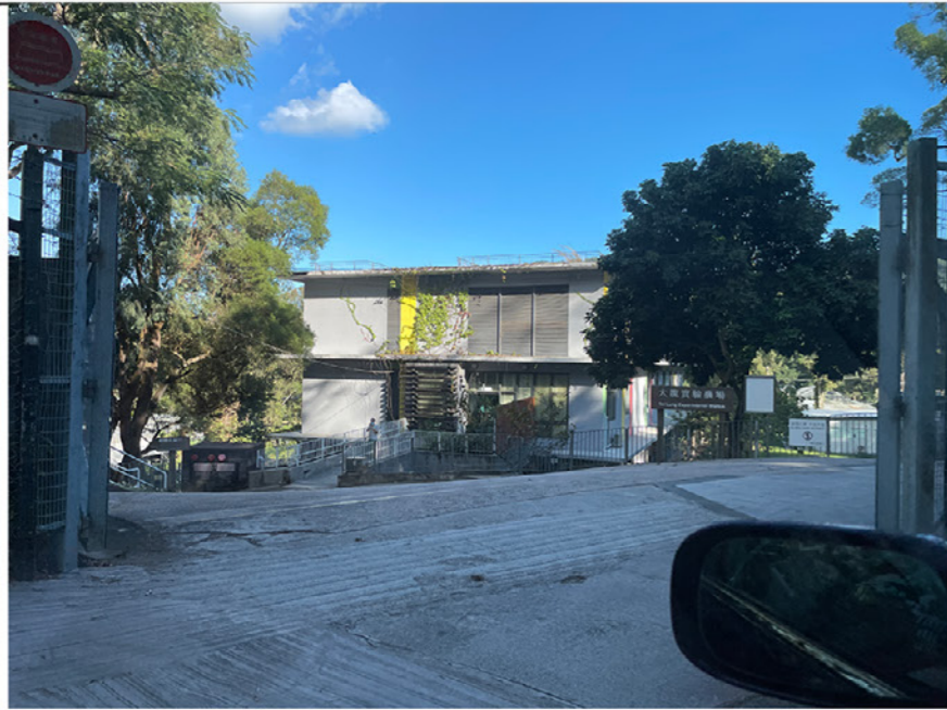
LR3.1 TAI LUNG EXPERIMENTAL FARM