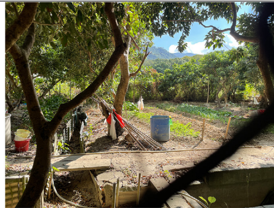
LR3.2 AGRICULTURE LAND AREA